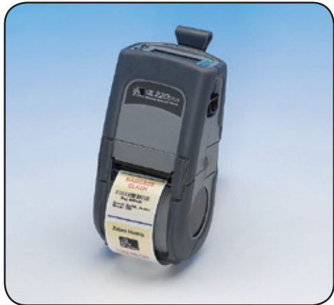
QL 220 Plus™

Take 2-inch label, ticket, and receipt printing where stationary and larger mobile printers dare not go—whether it’s down store aisles, on hospital rounds, or onto retail pharmacy counters. Strap or clip on the sleek, 1.04-pound QL 220 Plus network-addressable label/receipt mobile printer and move with ease!