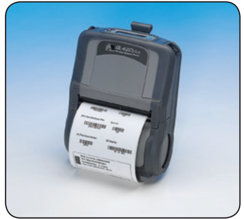
QL 420 Plus™

Bring the flexibility of wireless printing to your 4-inch label or receipt applications with Zebra’s QL 420 Plus mobile printer. Built to survive the rigors of warehousing, distribution, and route accounting, the QL 420 Plus offers a mobile mount option to allow printing in a forklift or vehicle.