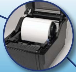
Drop - Load - Go Media Bin