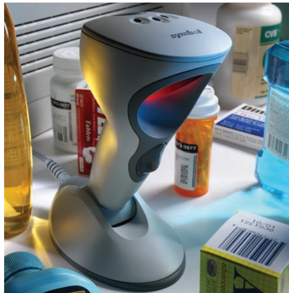
UCC/EAN Composite Symbology combines 1-D and 2-D scanning capabilities.