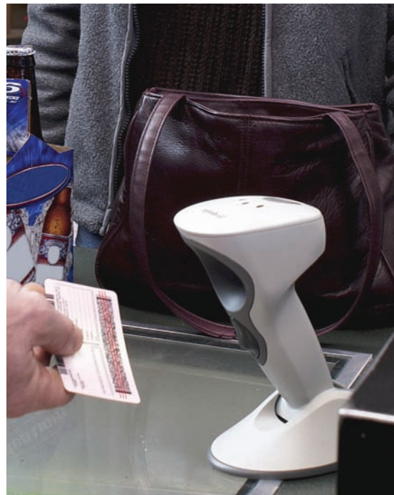
PDF417 bar codes are ideal for age verification applications