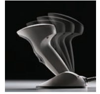
The adjustable built-in stand pivots to make scanning items easy – no matter how large or small.

For more information about the Symbol M2000 Cyclone Series, contact us at +1.800.722.6234 or +1.631.738.2400, or visit us on the Web at: www.symbol.com/m2000